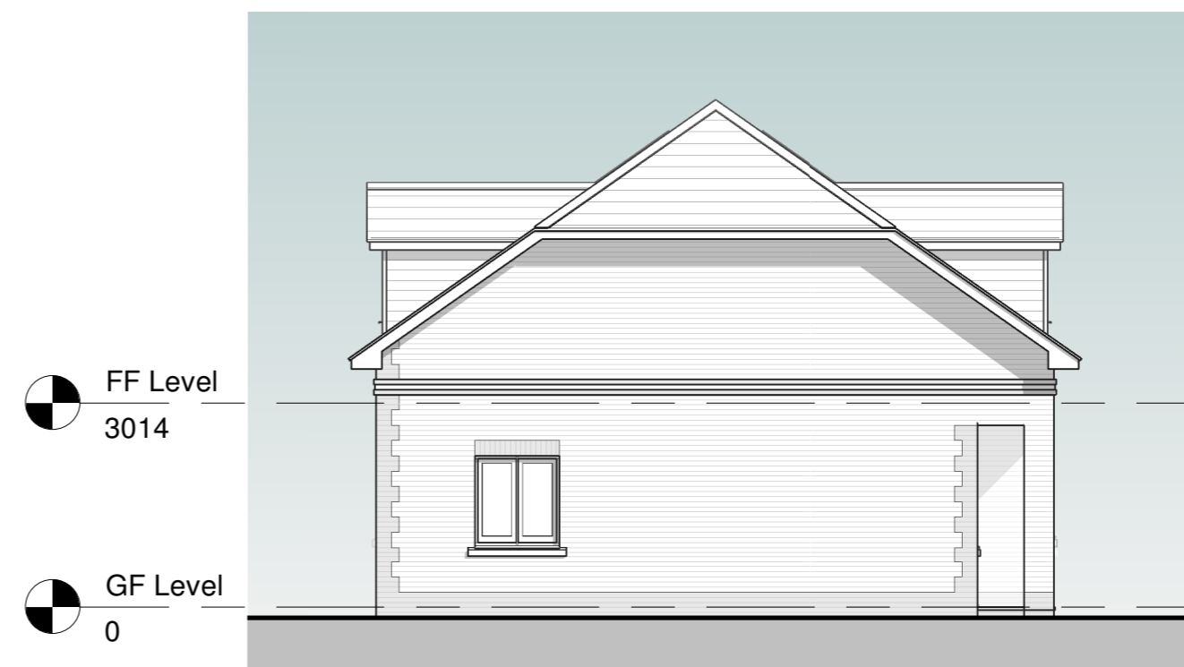
4 Side Elevation A 1 : 100