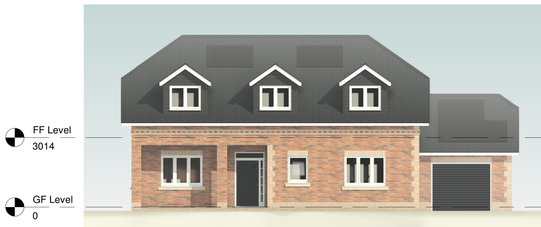
3 Front Elevation - Colour 1 : 100