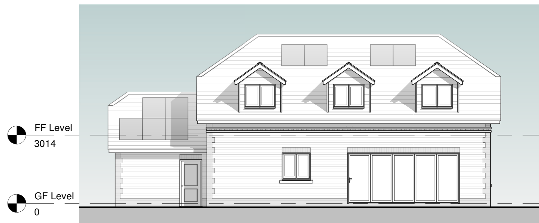
6 Rear Elevation 1 : 100