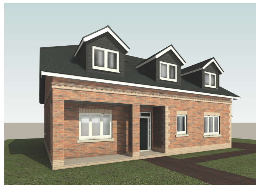
7 3D View 1