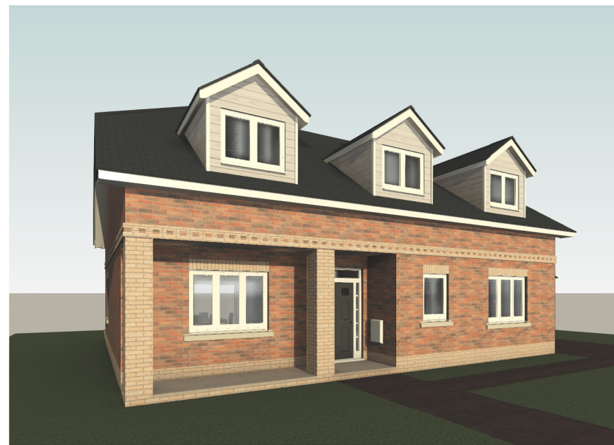
7 3D View 1