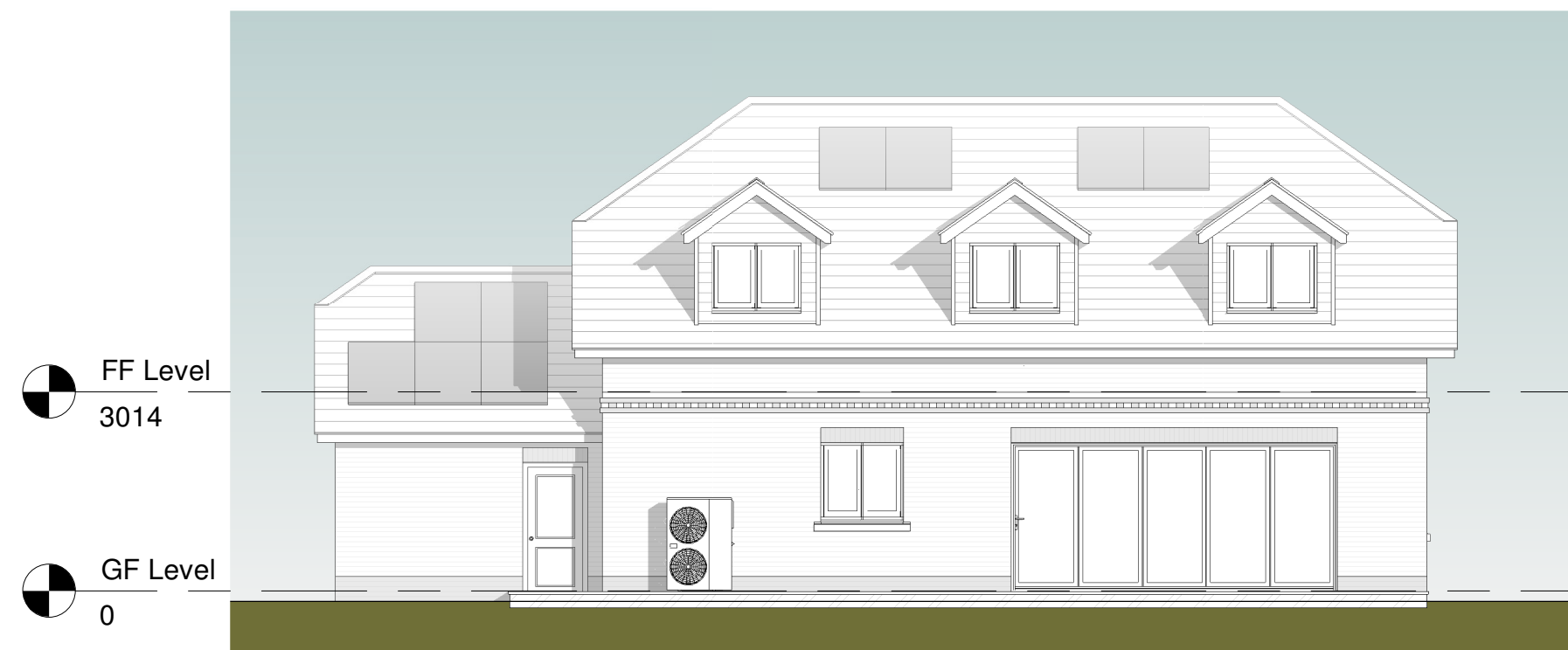
6 Rear Elevation 1 : 100