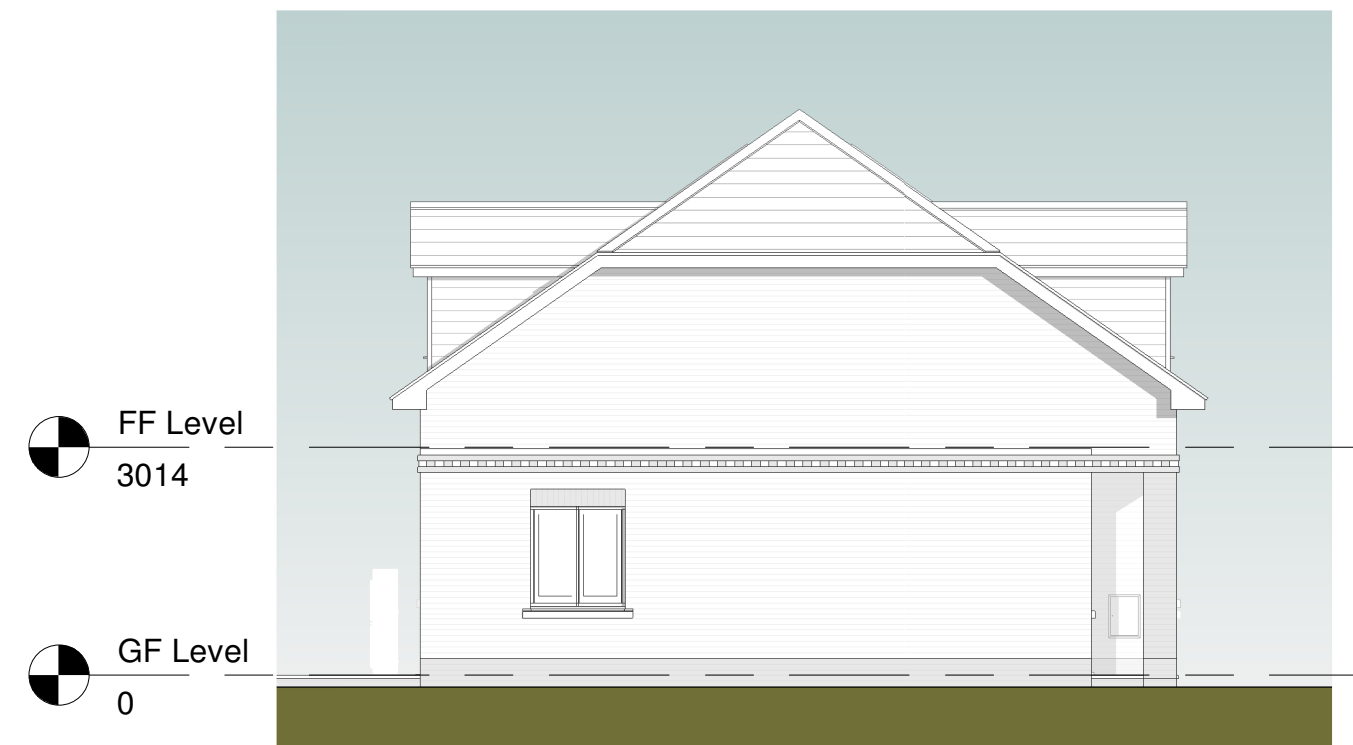
4 Side Elevation A 1 : 100