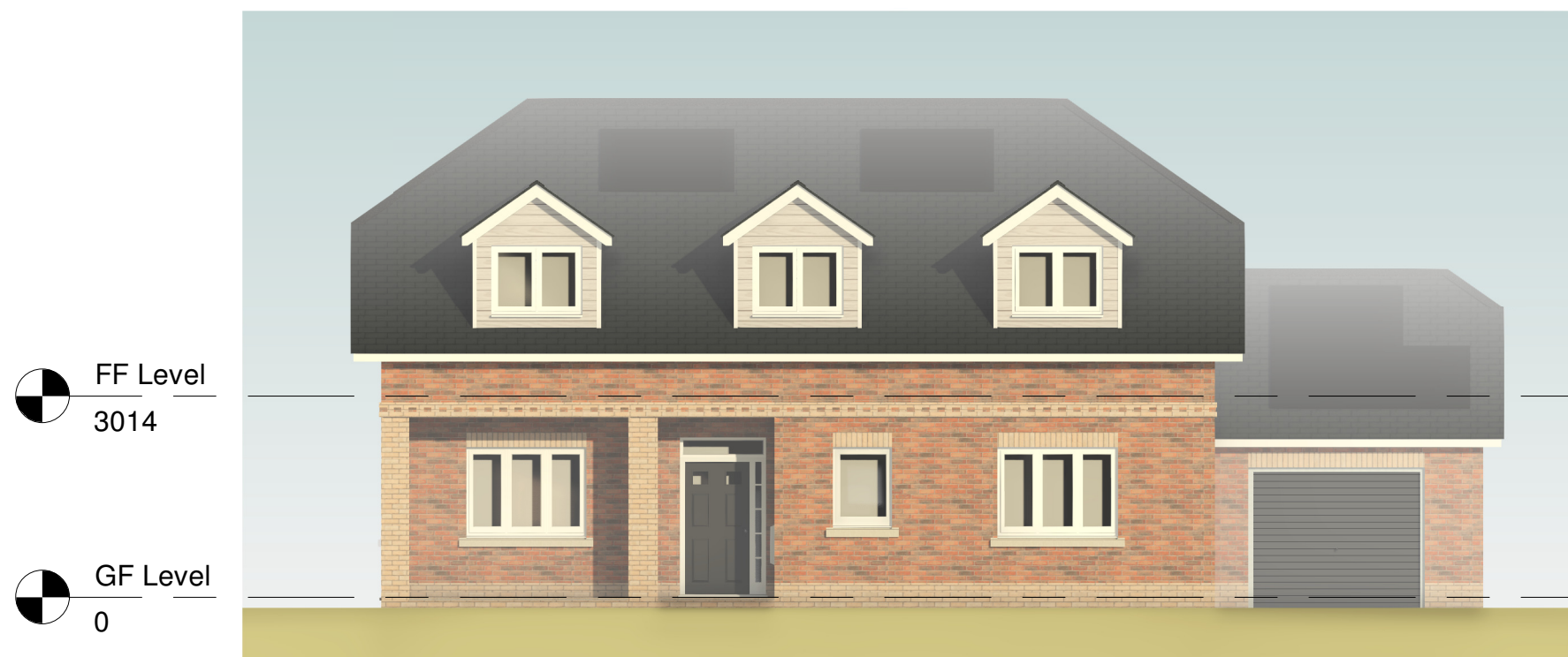
3 Front Elevation - Colour 1 : 100